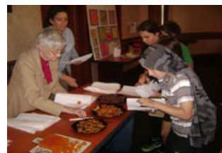
Carrot Fudge anyone?