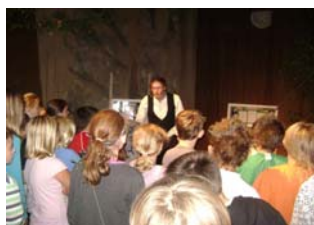
Vive la Resistance!

DRAMATIX TRUST LEST WE FORGET EDUCATION PROGRAMME FOR SCHOOLS