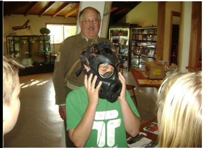
Hey—these things are uncomfortable! SIR GREG THEATRICALS LEST WE FORGET SCHOOL EDUCATION PROGRAMME