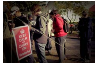
Queuing for Ration Coupons

DRAMATIX TRUST LEST WE FORGET EDUCATION PROGRAMME FOR SCHOOLS