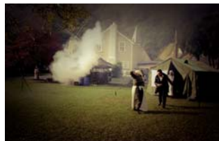
Air Raid—TAKE COVER!!

EVACUATION SEQUENCES THANKS TO NELSON RAILWAY SOCIETY