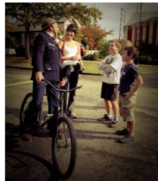
Are you in the Resistance?