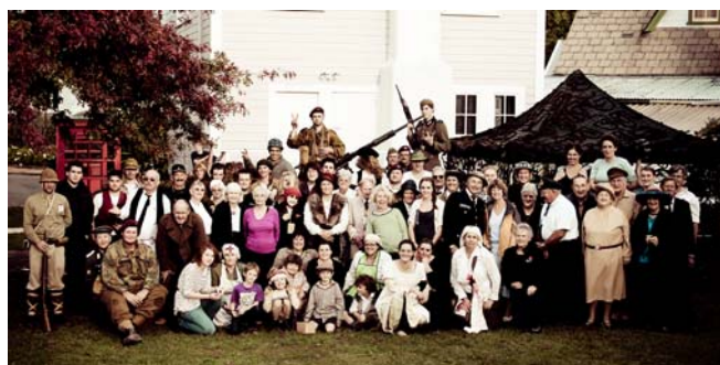
Our 2011 Volunteers

And if you know we missed anyone—it was not because we meant to—it just means the editor is an idiot.