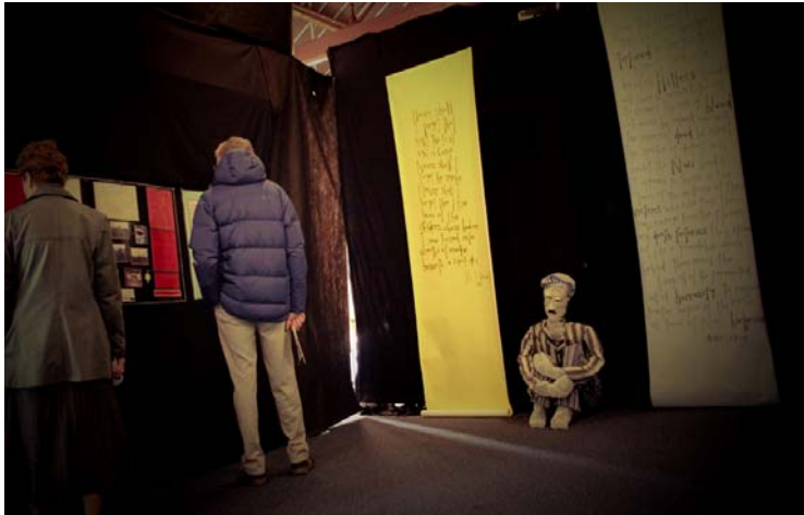
Why? THE HOLOCAUST DISPLAY

50% were returning visitors from previous years, and 50% were new visitors.